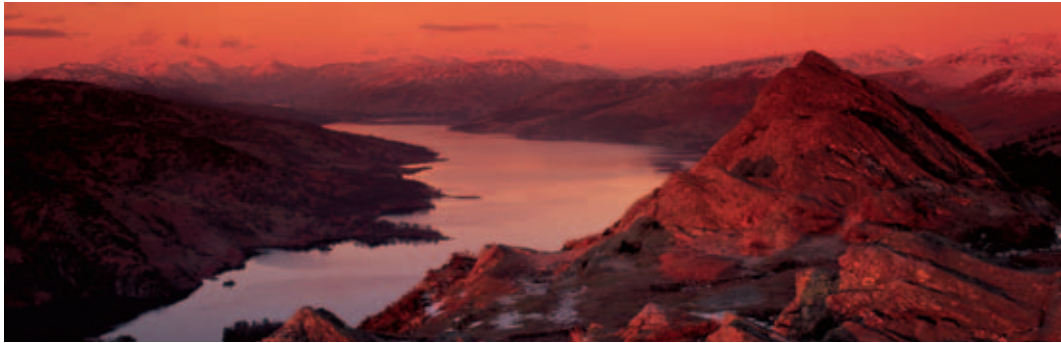
Murray Mowat Loch Katrine

MM0841 PAPER SIZE 890 x 350mm IMAGE SIZE 790 x 250mm