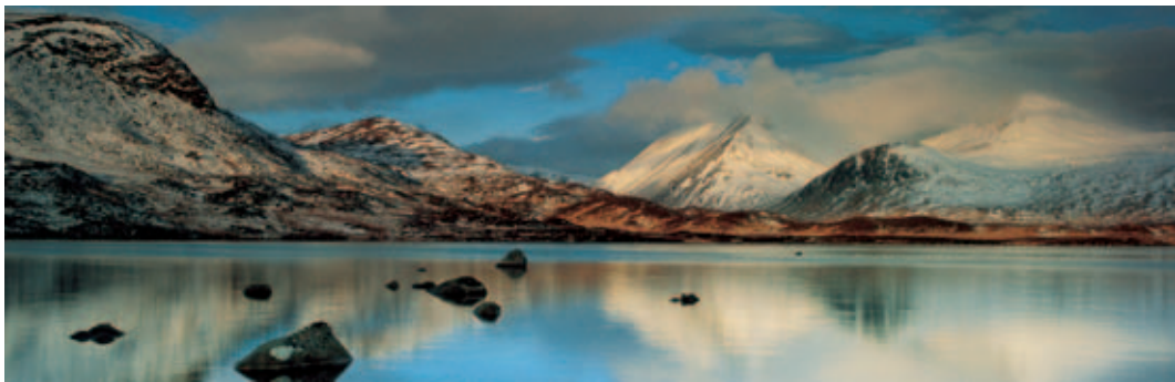
Murray Mowat Towards Rannoch Moor

MM0841 PAPER SIZE 890 x 350mm IMAGE SIZE 790 x 250mm