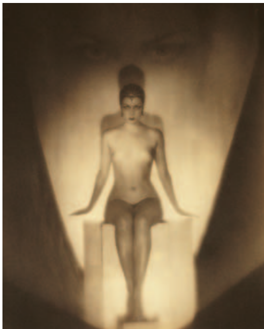
Skvirsky Deco Folio 3 SKV882 PAPER SIZE 500 x 700mm IMAGE SIZE 400 x 500mm