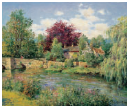
Jean Kevorkian Bridge at Ashford in the Water, Derbyshire EJK931 PAPER SIZE 765 x 650mm IMAGE SIZE 665 x 550mm EJK931A PAPER SIZE 235 x 200mm IMAGE SIZE 200 x 165mm