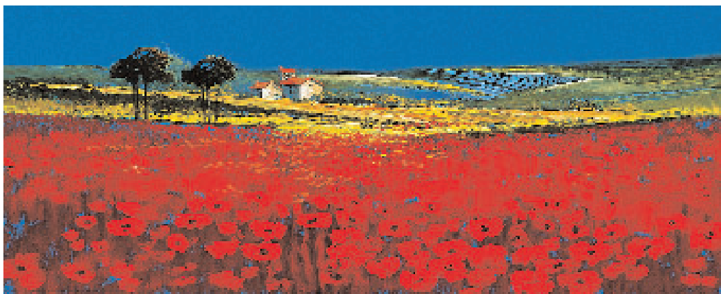
John Horsewell Red Fields, Tuscany

JOH858 PAPER SIZE 885 x 350mm IMAGE SIZE 785 x 250mm JOH858A PAPER SIZE 395 x 160mm IMAGE SIZE 345 x 110mm