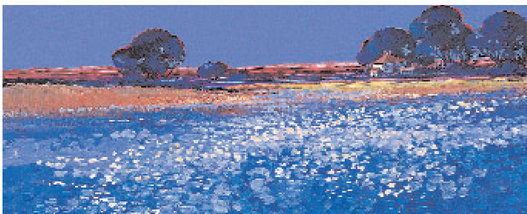
John Horsewell Blue Fields, Tuscany

JOH859 PAPER SIZE 885 x 350mm IMAGE SIZE 785 x 250mm JOH859A PAPER SIZE 395 x 160mm IMAGE SIZE 345 x 110mm