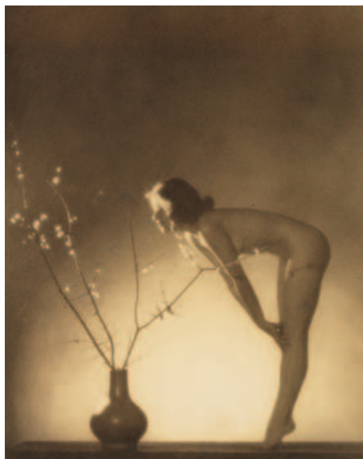
Skvirsky Deco Folio 2 SKV881 PAPER SIZE 500 x 700mm IMAGE SIZE 400 x 500mm