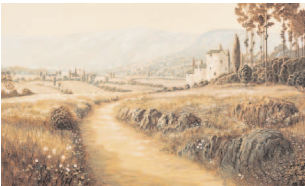
Arthur Claridge Winding Path, Tuscany

ECL443A PAPER SIZE 200 x 300mm IMAGE SIZE 150 x 250mm