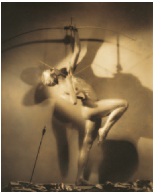
Skvirsky Deco Folio 1 SKV880 PAPER SIZE 500 x 700mm IMAGE SIZE 400 x 500mm