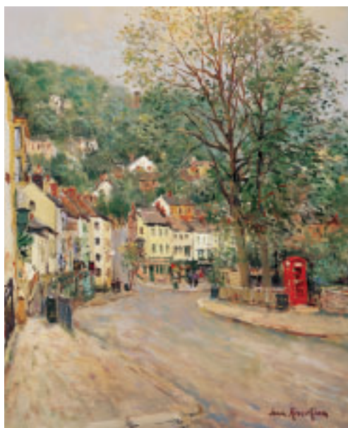
Jean Kevorkian Street in Matlock, Derbyshire EJK928 PAPER SIZE 650 x 765mm IMAGE SIZE 550 x 655mm EJK928A PAPER SIZE 235 x 200mm IMAGE SIZE 200 x 165 mm