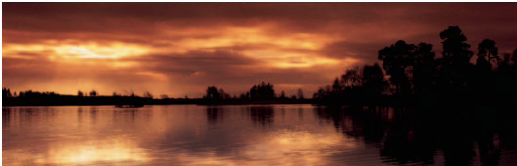
Murray Mowat The Trossachs

MM0840 PAPER SIZE 890 x 350mm IMAGE SIZE 790 x 250mm