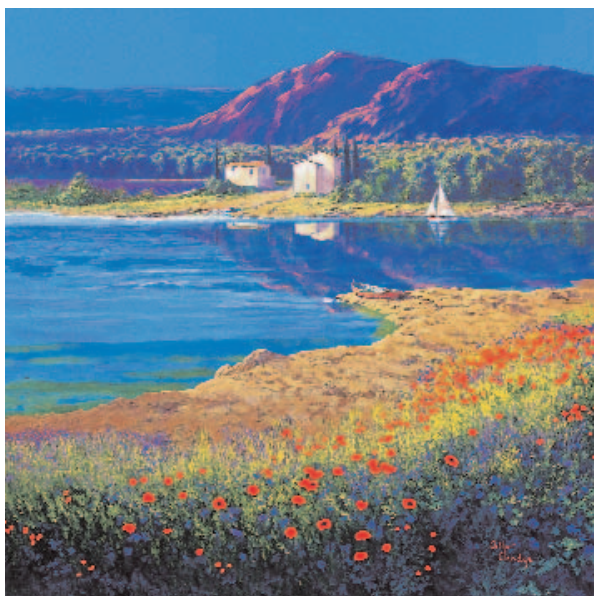
Arthur Claridge Poppies and Cypress Trees