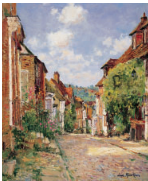
Jean Kevorkian Mermaid Street, Rye EJK929 PAPER SIZE 650 x 765mm IMAGE SIZE 550 x 655mm EJK929A PAPER SIZE 235 x 200mm IMAGE SIZE 200 x 165 mm

To view paintings by Kevorkian is sufficient to comprehend his ability and to understand immediately why his paintings appeal to countless buyers.