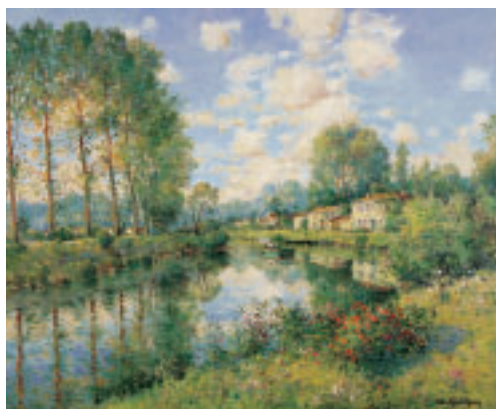
Jean Kevorkian Poplars in Poitevin Marsh EJK930 PAPER SIZE 765 x 650mm IMAGE SIZE 665 x 550mm EJK930A PAPER SIZE 235 x 200mm IMAGE SIZE 200 x 165mm