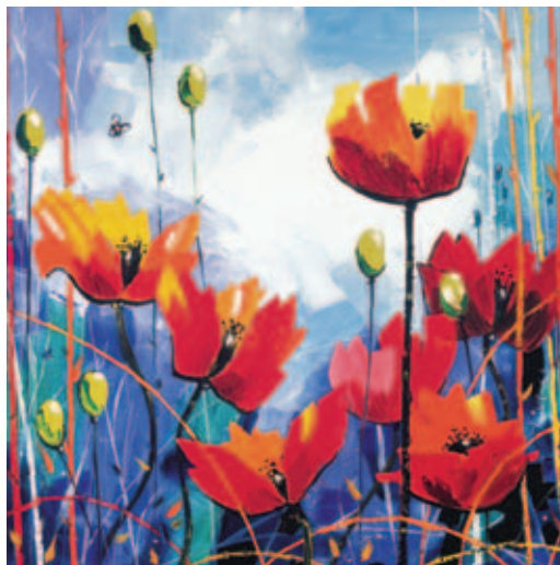
Daniel Campbell Poppies in Blue

Edition of 195 signed and numbered Printed on 315gsm Natural White Textured Rag