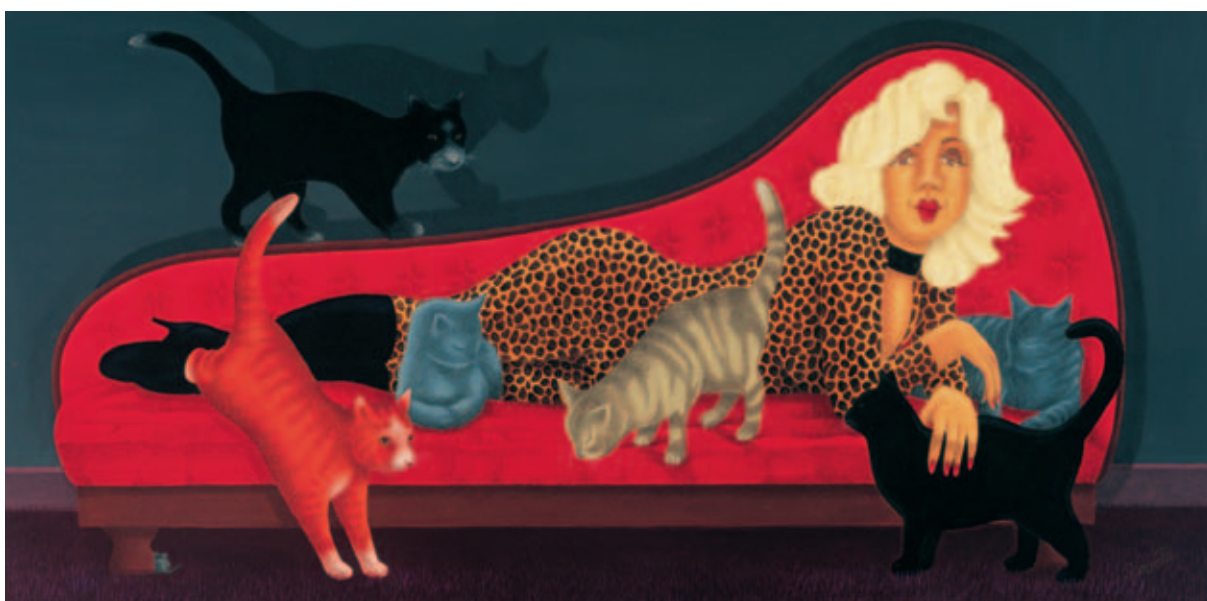
Joan Somerville Pussy Galore

Edition of 250 signed and numbered Printed on 315gsm Natural White Textured Rag