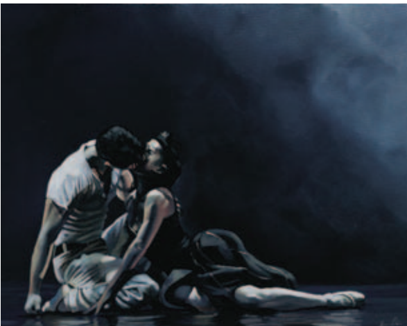
Gavin Penn One Kiss GPG18 IMAGE SIZE 550 x 450mm

Edition of 195 signed and numbered Printed on 315gsm Natural White Textured Rag