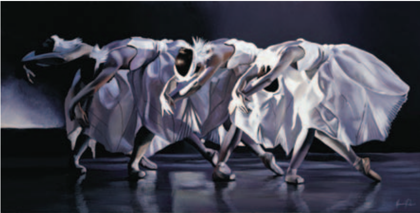
Gavin Penn Rising Swans GPG16 IMAGE SIZE 650 x 350mm

Edition of 195 signed and numbered Printed on 315gsm Natural White Textured Rag